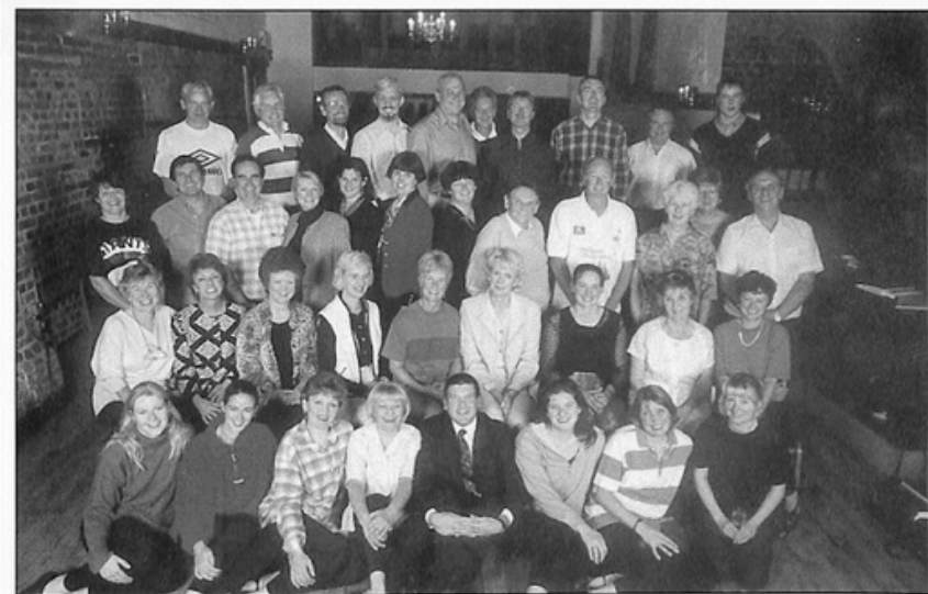
The 1998 Merry Widow Team

5 Collins Lane, Newland Street, Witham, Essex CM8 2EB Tel: 01376 502500 Fax: 01376 515506