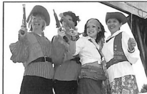
Pirate Queens at the Carnival