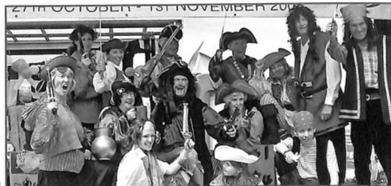
Pirates invade Witham during the Carnival